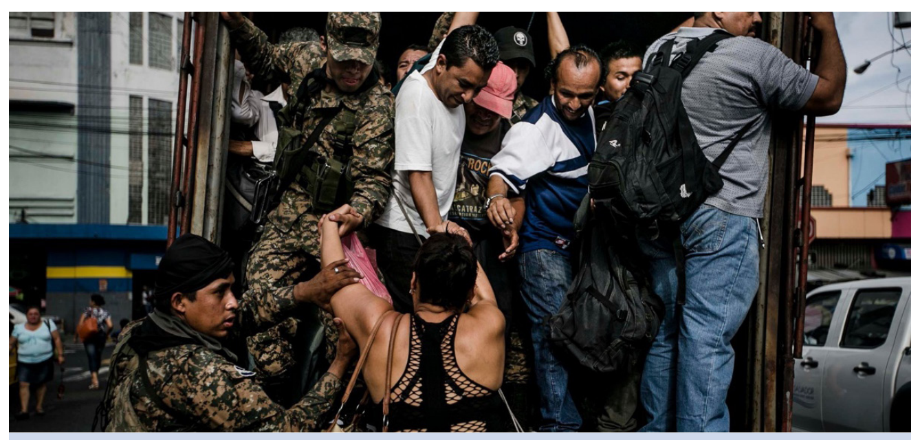
Photo caption: Soldiers guard civilians in El Salvador after gangs threatened to kill bus drivers who don't pay extortion.

The MS 13 has never before participated in such a broad, mainstream movement with formal political power. Similarly, the regional Bolivarian movement<sup>16</sup> has never previously enjoyed access to allies with significant territorial control in Honduras. In our assessment, the advantages of a closer alliance between these two entities would provide benefits to both sides while continuing to operate independently in most areas.