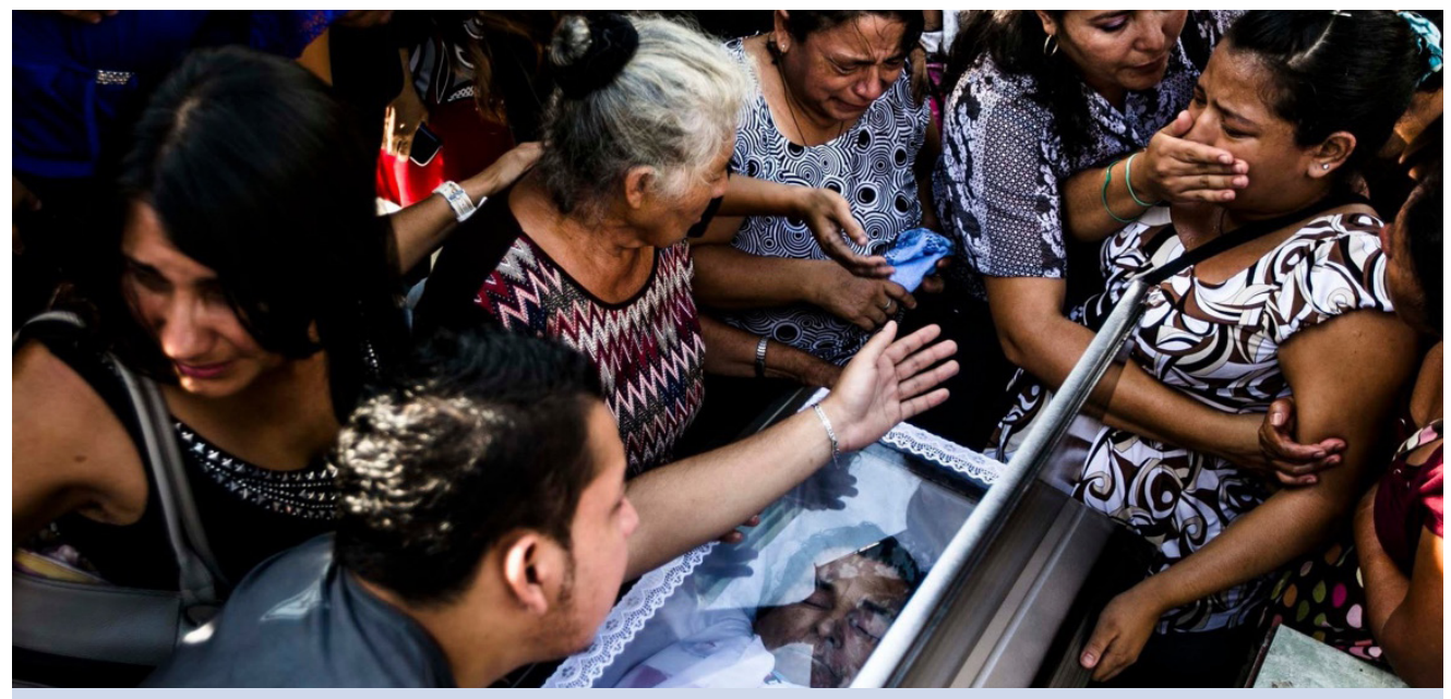
Photo caption: Family members gather at the funeral for a bus driver murdered by the Maras in Aguilares, El Salvador in September 2016.

While it has been long established that the gang leaders had directly negotiated with leaders of El Salvador's two main political parties, the magnitude of what was negotiated has recently come to light. Over the past year, the MS 13 has posted a series of YouTube videos and audio recordings of their leadership directly negotiating with leaders of the two main political parties, the right wing Republican Nationalist Alliance ( Alianza Republicana Nacionalista – ARENA) and the former guerrillas of the Farabundo Marti National Liberation Front ( Frente Farabundo Marti Para la Liberación Nacional – FMLN), for monetary gain and political power.