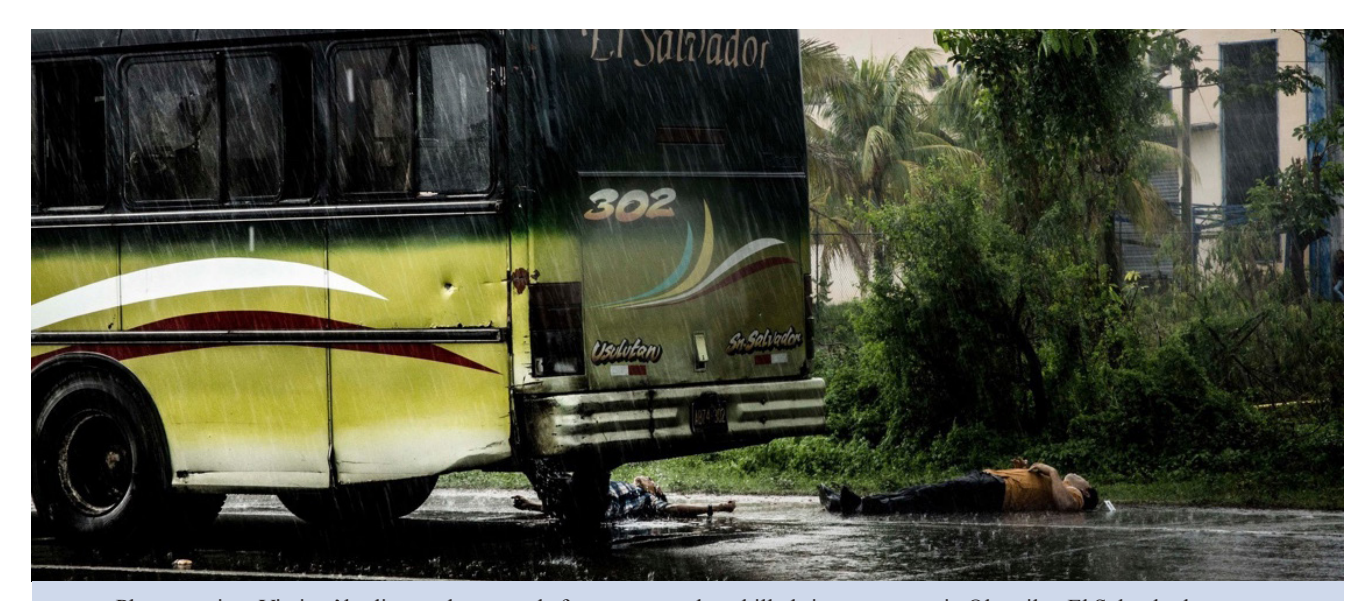
Photo caption: Victims' bodies on the ground after gang members killed six passengers in Olocuilta, El Salvador because the owner refused to pay extortion.

There are significant rumblings of changes underway inside the MS 13. Even as other gangs have fractured in El Salvador – in the case of the Barrio 18, into the Sureños and Revoloucionarios - the MS 13 alone has evolved politically, militarily and economically to challenge the survival of the state. There is now considerable debate over a possible split in the MS 13 in El Salvador, between the ranfla histórica (historic gang leadership, mostly in prison) and the ranfla libre (gang leaders on the outside