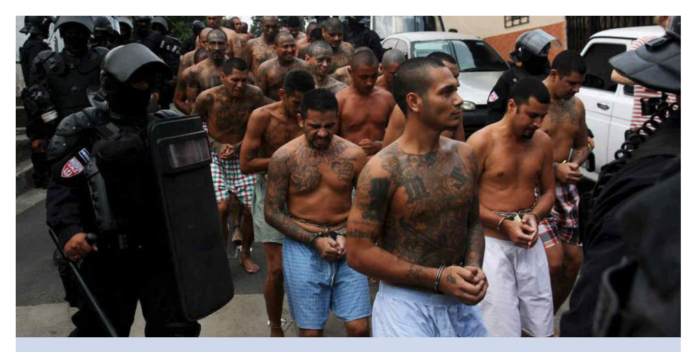
Photo caption: Members of the Mara Salvatrucha arrested in El Salvador in 2016.

This report draws upon findings from field investigations by seven researchers throughout the Northern Triangle over the past year. During that time, we conducted interviews with gang leaders of both the MS 13 and Barrio 18 gangs; residents of gang-controlled territory; law enforcement officials; journalists; and academics.