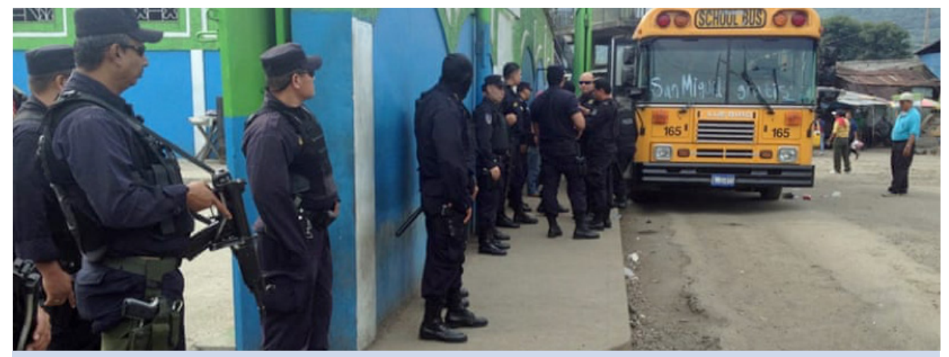
Photo caption: A heavy police presence is visible in many Salvadoran cities because of extreme gang violence.

"We have our new orders from the new business structure of our organization," said one midlevel MS 13 leader during a November interview in San Pedro Sula, Honduras. "All we care about is drugs, how to get it, how to move it, how to sell it. We have our territory now, and we make a lot more money. We don't meet our leaders face to face anymore, we only talk by special telephones, for security. We all get paid now, we work set shifts, we have AK 47s and mini Uzis, we have orders not to let anyone mess with civilians. The last two years have been amazing."