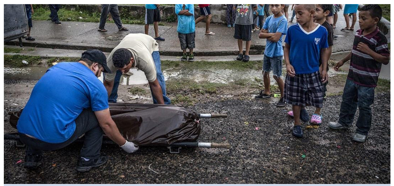
Photo caption: A victim of gang violence in taken away in San Pedro de Sula in 2016.

The November 2017 elections in Honduras heralded a seismic shift in the MS 13's political involvement. In stark contrast to prior contests, the organization took the unprecedented step of allying itself with a particular ideology, and engaged in overt political violence in concert with some of the region's criminalized populist movements from around the region in an attempt to reshape the country's political order.