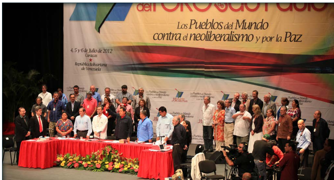
Photo caption: Venezuelan President Hugo Chavez presides over the Foro de Sao Paulo in Caracas, Venezuela in July 2012, less than a year before his death.

Following his election as Venezuela’s president in 1998, Hugo Chávez would spend the next almost two decades systematically transforming Petróleos de Venezuela, S.A (PDVSA – the Venezuelan national oil company). The result was a multi-billion-dollar political and criminal enterprise operating in concert with sympathetic political leaders, economic elites and criminal organizations. While first Chávez, then Maduro, led the project, they are aided by the political allies in Cuba, Nicaragua, Bolivia, Ecuador, Suriname, El Salvador as well as the FARC rebels in Colombia and extra-regional actors, primarily Russia. We define this alliance as the Bolivarian Joint Criminal Enterprise, (BJCE). 10 One of the group’s primary ways of coordinating strategy, messaging and tactics has been through international solidarity conferences.