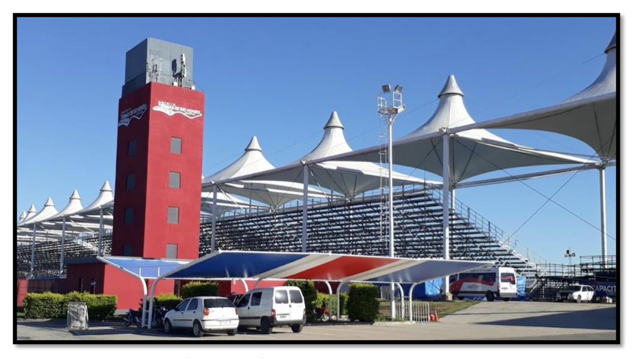
Figure 6: The Rio Hondo speedway (IBI Consultants)

One of the few people to use the new international airport at Rio Hondo, about 45 miles outside to the provincial capital, is Zamora, who, according to documents reviewed by IBI Consultants, used public funds to purchase Lear Jets described as air ambulances and a Boeing 737 that is in the United States being retrofitted for special flying conditions. There are extensive media reports