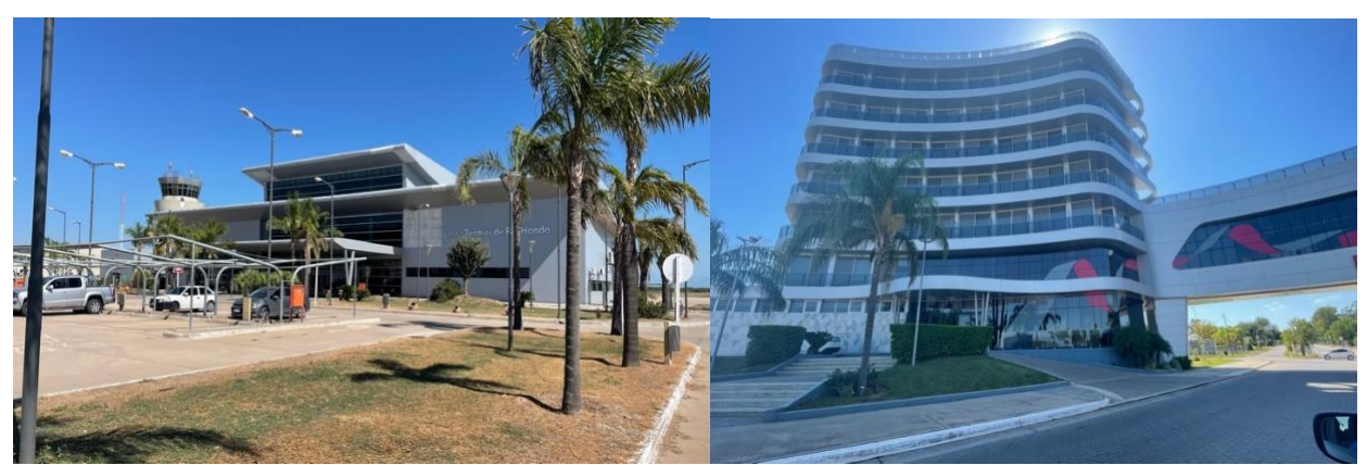
Figure 7: The empty Rio Hondo International Airport (left) and an empty luxury hotel near the Rio Hondo speedway (right) (IBI Consultants)

detailing Zamora's use of provincial aircraft to fly Argentine pesos, constantly devaluing due to rampant inflation, to Bueno Aires to purchase thousands of U.S. dollars as a hedge against devaluation; there are also records of two flights to New Orleans with a stop in Panama, and other non-medical related flights.<sup>27</sup>