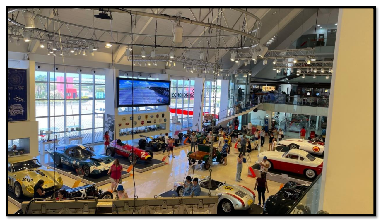
Figure 5: The Rio Hondo Museum of racing cars and motorcycles (IBI Consultants)

One of the few people to use the new international airport at Rio Hondo, about 45 miles outside to the provincial capital, is Zamora, who, according to documents reviewed by IBI Consultants, used public funds to purchase Lear Jets described as air ambulances and a Boeing 737 that is in the United States being retrofitted for special flying conditions. There are extensive media reports